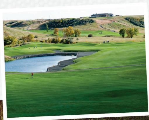
Challenge yourself at Hawktree Golf Course in Bismarck with black coal slag bunkers and North Dakota's legendary wind.

Experience world-class golf offered by Hawktree Golf Club, the Links of North Dakota and Bully Pulpit Golf Course, plus 15 additional golf experiences along the Lewis & Clark Golf Trail, following the path blazed by the intrepid explorers. When the clubs aren't in play, continue the journey by visiting nearby historic sites. www.lewisandclarkgolftrail.com