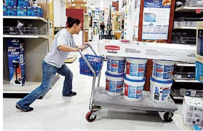
A shopper fills her cart at a Bismarck home-improvement store